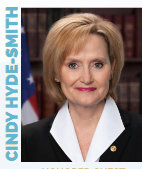
HONORED GUEST SEN. CINDY HYDE-SMITH SENATE COMMITTEE ON APPROPRIATIONS