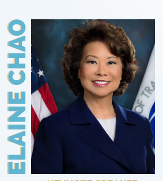
KEYNOTE SPEAKER ELAINE CHAO UNITED STATES SECRETARY OF TRANSPORTATION

7:30 AM - 12 NOON: TRANSPORTATION SUMMIT | 12 NOON - 1PM: CASUAL LUNCH & EXHIBITIONS 1PM - 3PM: JOINT LAND USE FORUM