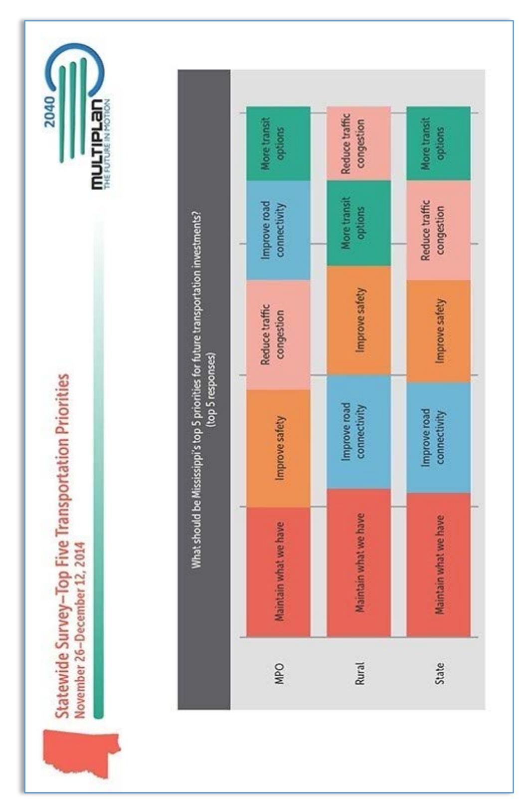
Figure 2-1: Statewide Telephone Survey Results