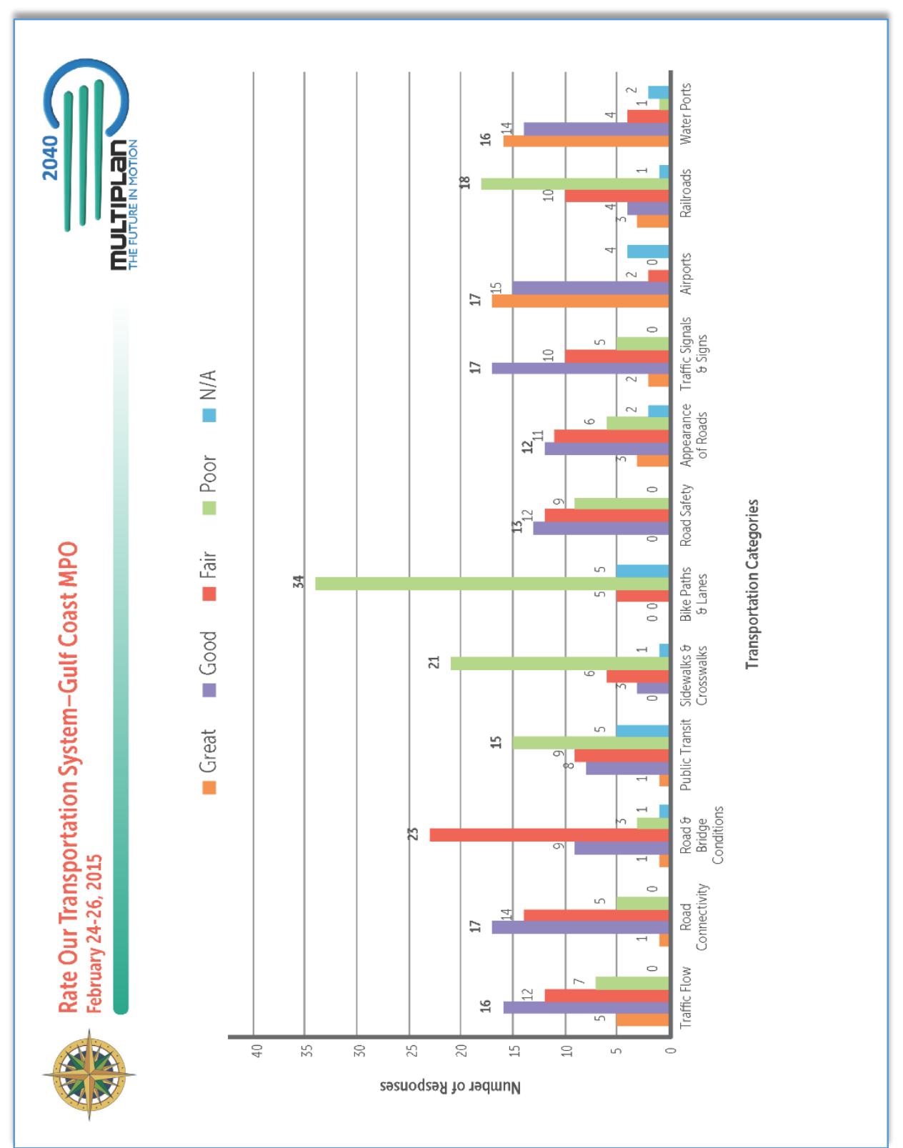
Figure 2-3: Public Input Regarding Performance of Existing Transportation System