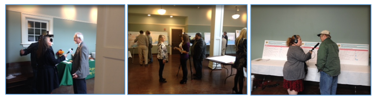
Media interviews of GRPC staff and members of the community helped get the word out about plan development.

In support of the joint MDOT-MPO MindMixer effort, push cards were distributed to MPO membership, e-mails were sent to individuals on the statewide stakeholder list, and printed cards were handed out during the first round of public meetings. These cards "pushed" individuals to continue to follow the planning process and provide their feedback through the MindMixer forum. In short, the site afforded an additional opportunity for interested parties to participate in the planning process despite scheduling challenges or other barriers that kept them from attending on-site public meetings.